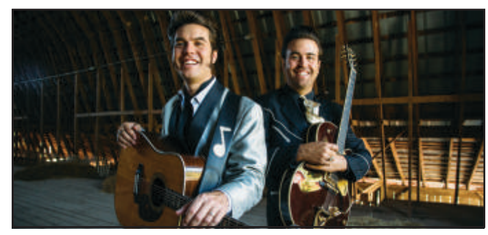
The Malpass Brothers (Saturday Only)