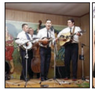
Robertson County Line