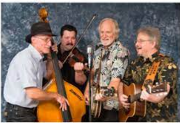
The LONESTAR BLUEGRASS BAND