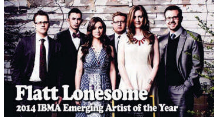
Flatt Lonesome 2014 IBMA Emerging Artist of the Year