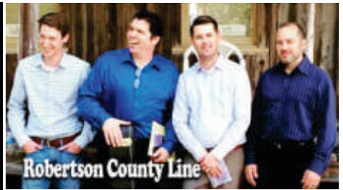
Robertson County Line