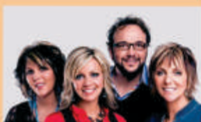
The Isaacs Thursday