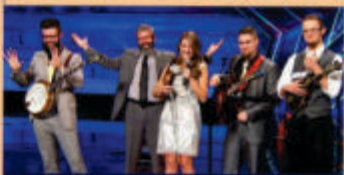
Mountain Faith Saturday & Sunday