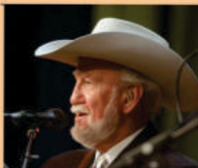
Doyle Lawson & Quicksilver Saturday & Sunday