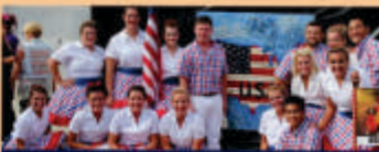
Bailey Mt. Cloggers Wednesday- Saturday