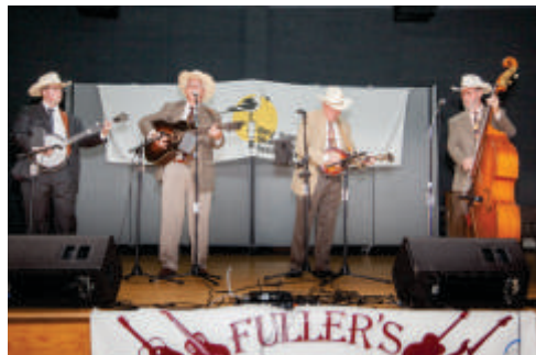
THE BLUEGRASS SOLUTION