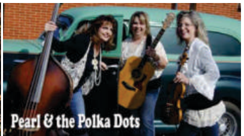
Pearl & the Polka Dots