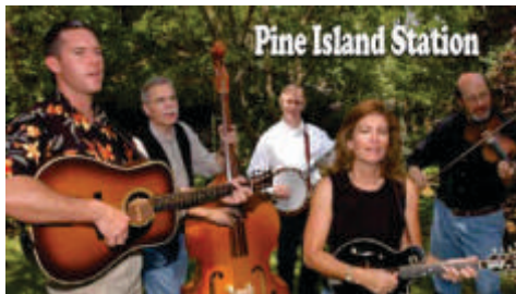
Pine Island Station