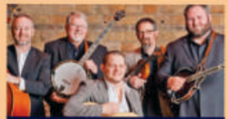
Balsam Range Friday