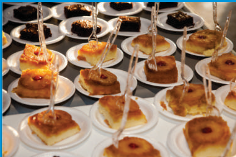
Musicians invented the street sign: "Will work for food!"

Are you and your bluegrass or bluegrass gospel band interested in playing at one of our regular monthly shows in League City?