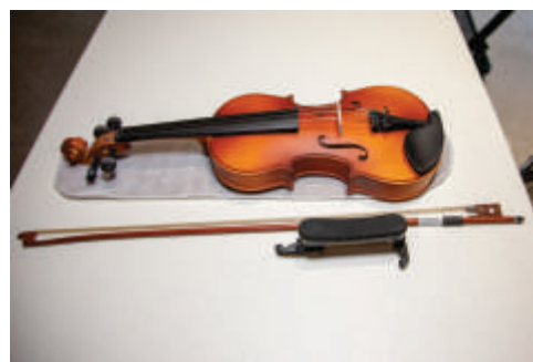
Fiddle Kit: Playing It Forward