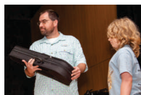
Awarded to: The Gibson Family